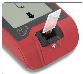
2 Place microcuvette into analyzer.