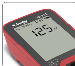
3 View results.

HemoCue AB | PO Box 1204 | SE-262 23 Ängelholm | Sweden Phone +46 77 570 02 10 | Fax +46 77 570 02 12 | info@hemocue.com | hemocue.com